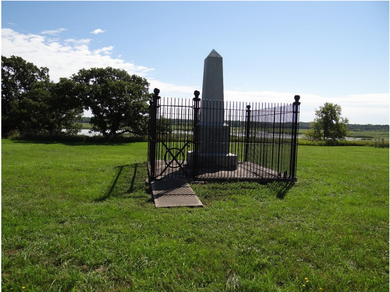
Newel's Grave Monument, 2020