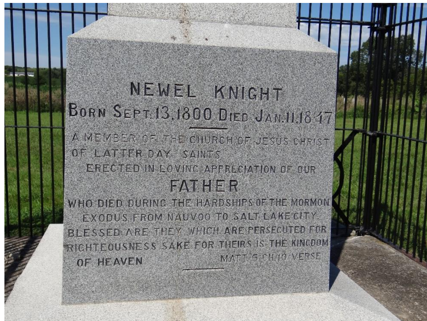
Photo of monument inscription