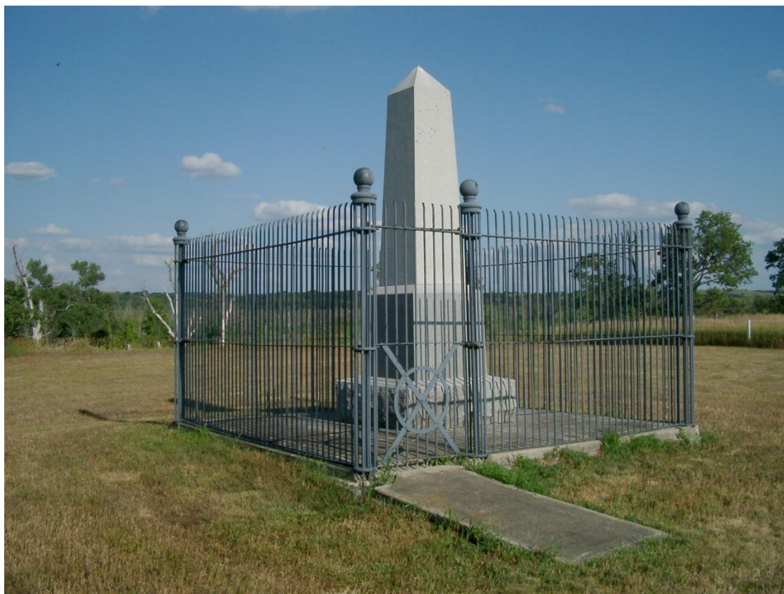
The Newel Knight Grave Monument several years ago