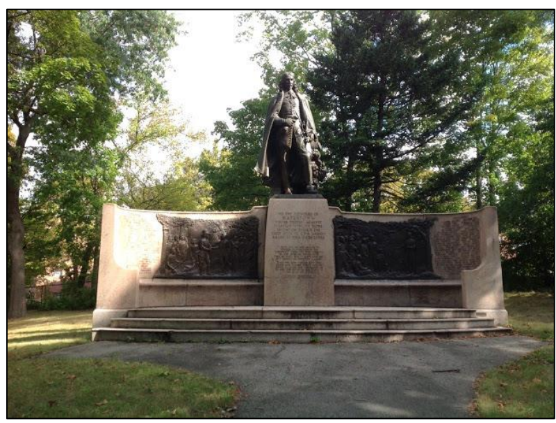
The Watertown Founders Monument The 109 Founders are listed alphabetically. The man honored with a statue is Richard Saltonstall. Watertown was built in 1630 on the Saltonstall Plantation land.vi